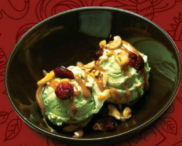
HOMEMADE AVOCADO ICE CREAM 690 RSD HOMEMADE COCONUT ICE CREAM 690 RSD Contains: dairy (cream, milk), nuts (cashew)