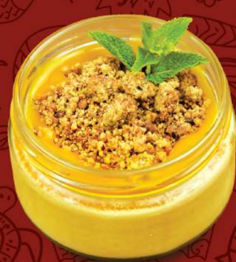
MANGO PANNA COTTA 650 RSD Contains: dairy (butter, cream), nuts (pistachio), gelatin.