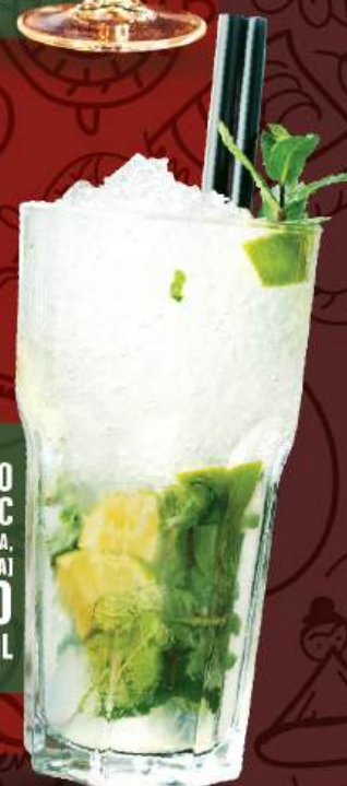
GIANT MOJITO CLASSIC (LIMEKA, LIMUN, MENTA, BELI RUM 75ML, GAZIRANI SOK OD LIMUNA) 890 RSD 650 ML