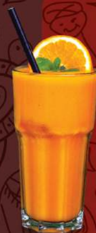
FROZEN MANGO CRUSH 590 RSD 650 ML