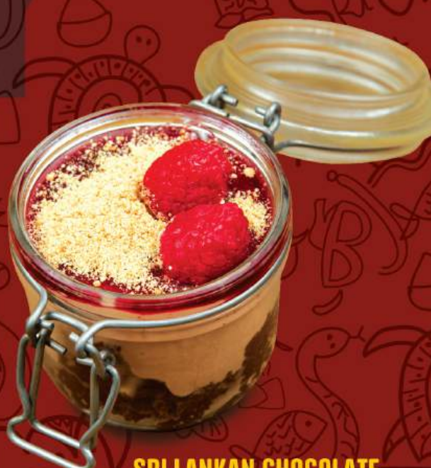
SRI LANKAN CHOCOLATE BISCUIT PUDDING 590 RSD Contains: dairy (butter, cream, milk)